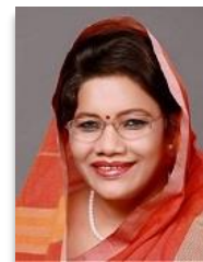
Minister of State, Smt. Renuka Singh Saruta