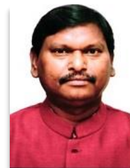
Minister of Tribal Affairs, Shri Arjun Munda

On 15th May 2020, Hon'ble Minister of Tribal Affairs, Shri Arjun Munda launched GOAL initiative, a Facebook funded program in collaboration with the Ministry of Tribal Affairs, aimed at upskilling and empowering tribal youth across India to become digital young leaders. This event was also graced by the presence of Hon'ble MoS, Smt. Renuka Singh Saruta.